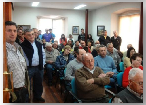
ASTUR GOLD CORP